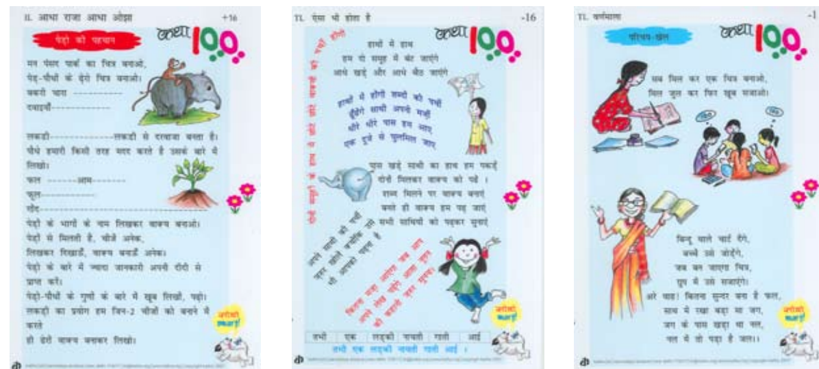
samples of Katha:100 supplied to schools