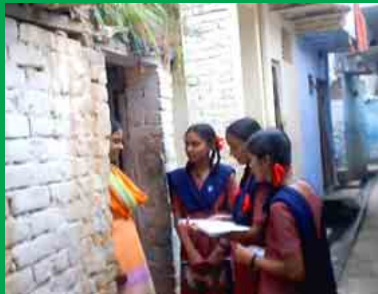
A STUDENT SURVEY: IN THE COMMUNITY

KATHA'S LIFE knowledge emphasizes: L iteracy to lifelong learning. I ncome-generation. F amily well being. E mpowerment.