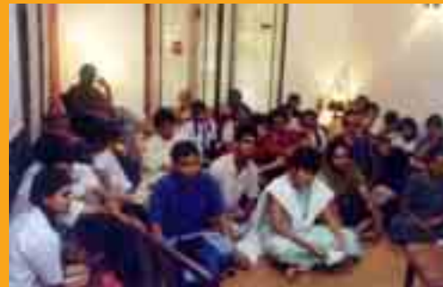
A KATHA FACULTY CLUB MEETING